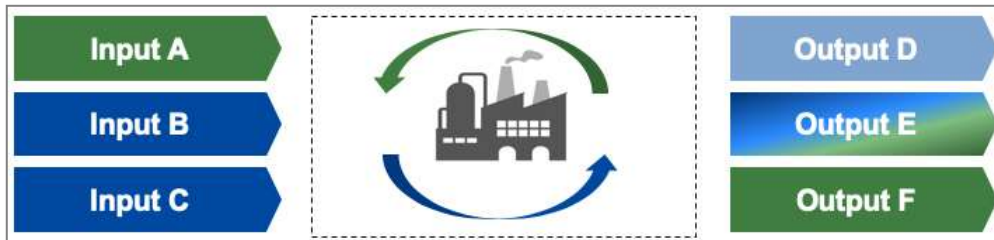
Figure 2: Schematic view on the free attribution approach under ISCC PLUS

The sustainable output can be determined using an “attributing approach” (Option 1 and 2, see Figure 3). In this case, the site processing unit defines the system boundaries”. The specific processes (e.g. chemical reactions) within the system boundaries of the respective processing unit are not taken into account for the determination of the sustainable share. Thus, the focus of the analysis is exclusively on the relevant input, output and losses of the process. In order to calculate the sustainable share, the amount of sustainable input, output and the losses can be described based on their mass ( Option 1, Mass Determination ) or based on their energetic value ( Option 2, Energetic Determination ).